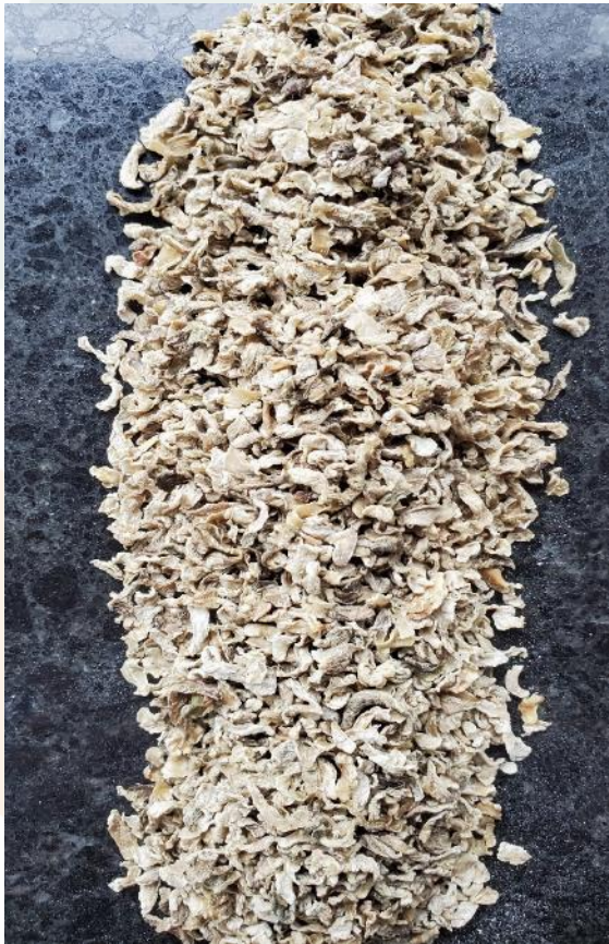
Un-milled, coarse fibres